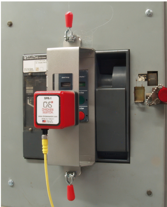
Picture A - SPB-1 shown installed on breaker