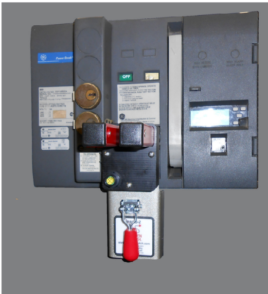
Picture A - GEPB-2 shown installed on breaker