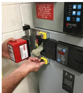
Turn magnets to engage