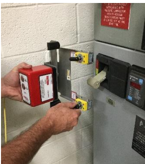
Position actuator over control switch